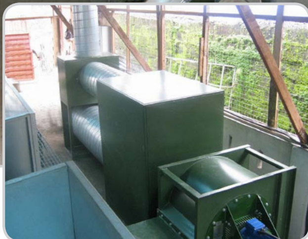
◀ Fan and heat exchanger