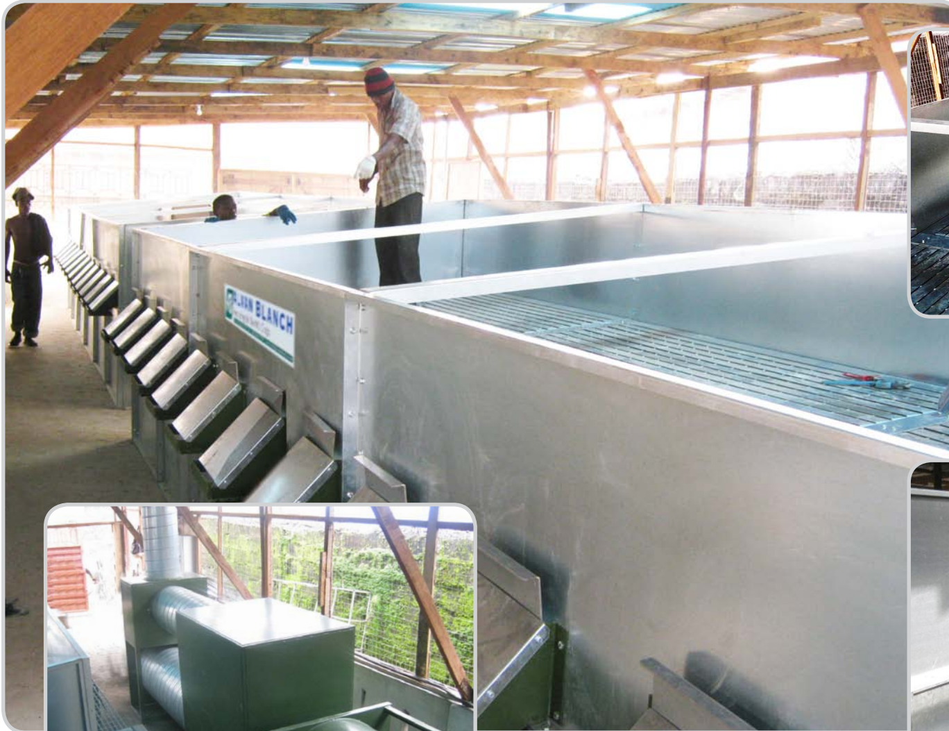
▼ The BD7500/2E during site assembly