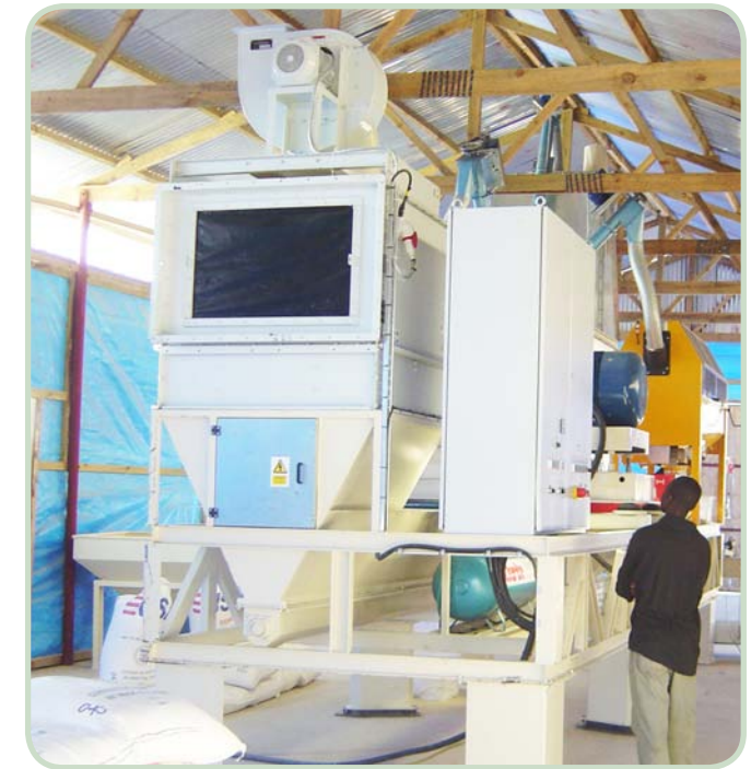
▲ The control panel and close up of the filter unit.