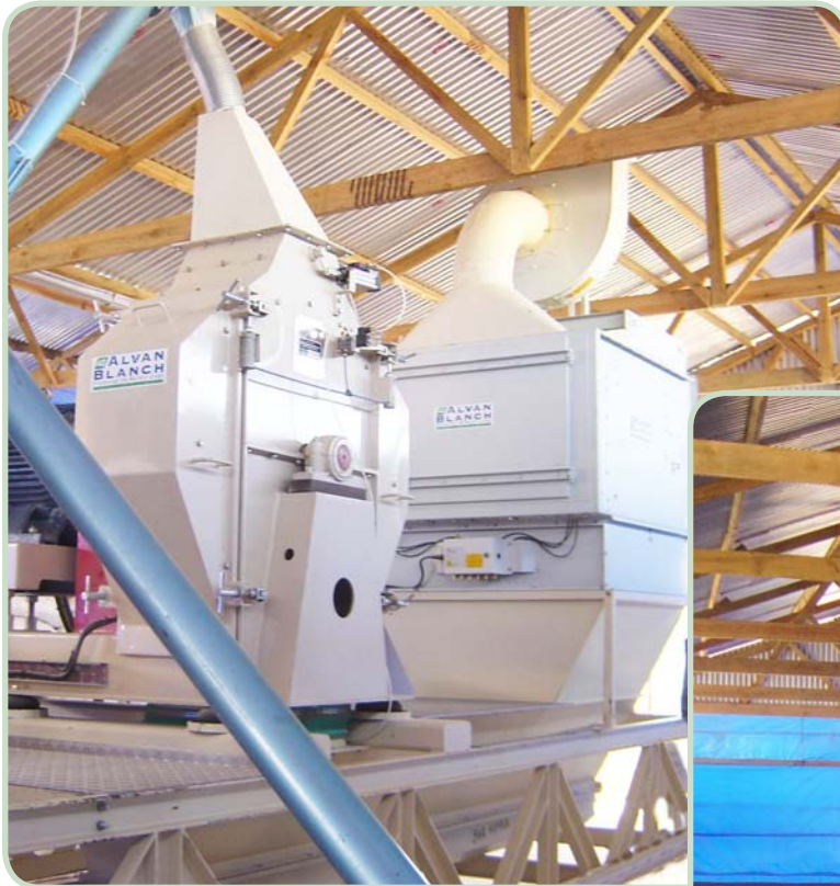
◀ High performance hammermill with dust filtration unit.

DESIGNED AND BUILT FOR UN-WFP FOR EAST AFRICA